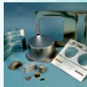
Flexformed parts for prototyping and small series production