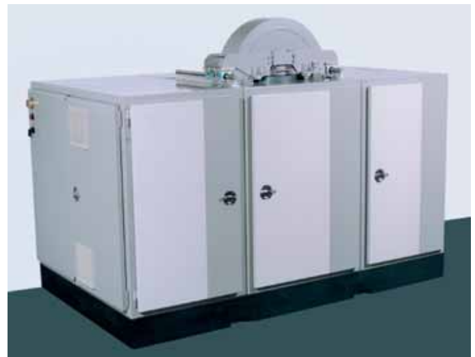
Models MIH-3, Q/MIH-9 and QIH-15