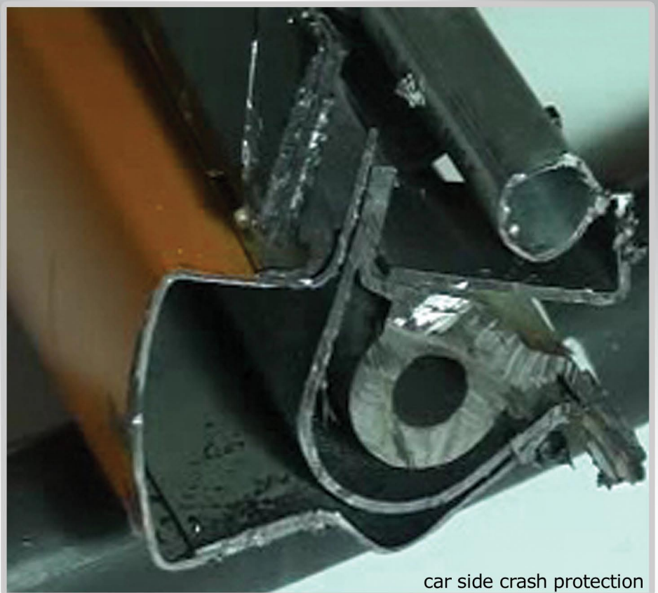
car side crash protection