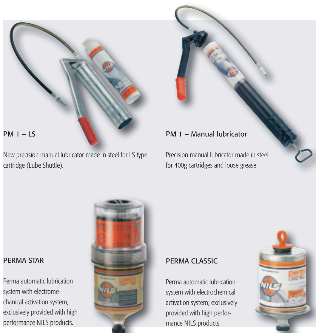
PM 1 – LS

More productivity and better performances. With security and less emission!