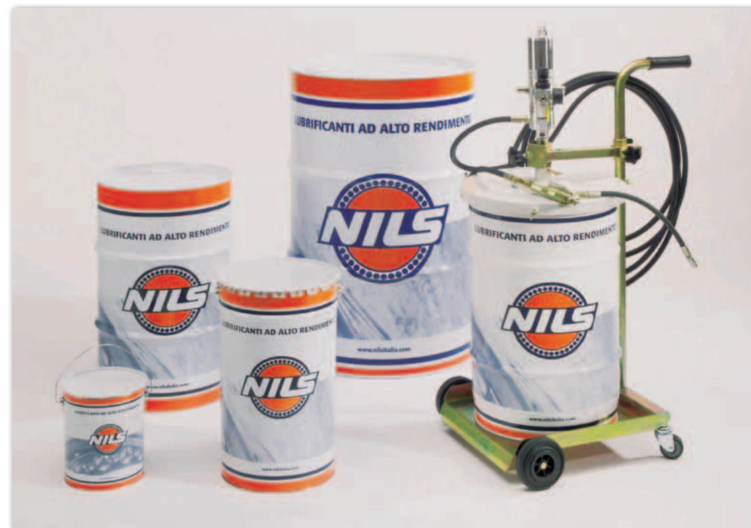
PA 50 – Pneumatic pump set

Perma automatic lubrication system with electrochemical activation system; exclusively provided with high performance NILS products.